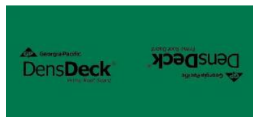
New Printing on Mat