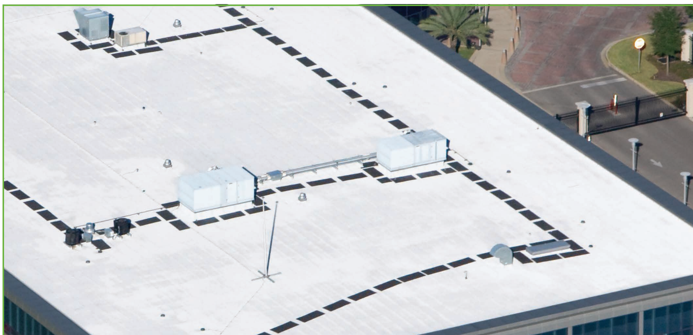
FlexGuard™ Peel & Stick™ WalkWay Pads on top of FlexWhite™ Membrane